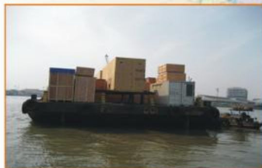
Kongpong Cham Electric Power Station, Mekong River Transportation, January 2007