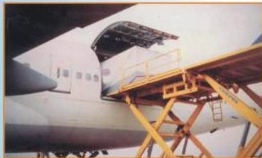
A telecommunication station with size 01x20'DC - weight 20,000kgs from Paris to Hanoi for exhibition show and returned Paris after exhibition ended, 1994