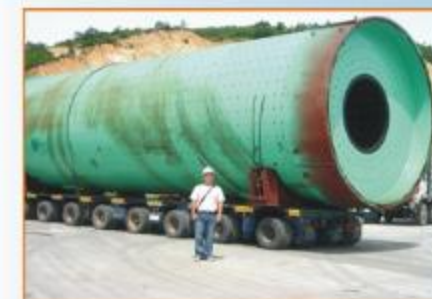
Nghi Son Cement Company The 2 nd production line, 2008 - 2009