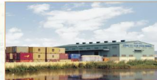
Tan Tien Phong's Haiphong Warehouse and Container Terminal