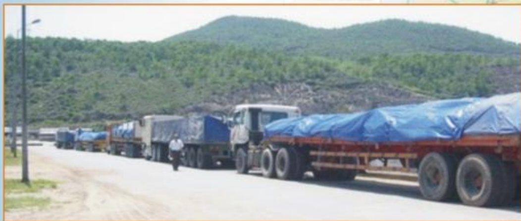
Leo Cement Project (Thakhek) - Cargo transited via Vietnam, 2005 - 2006