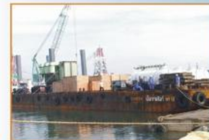
Phu My 3 Power Station with transformer 220tons from Singapore to erection position, Phumy Vietnam, Jan-2008