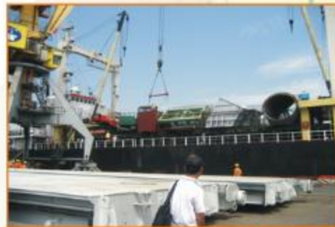
Chinfon Cement Company The 2 nd production line, October 2007